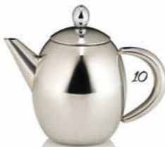
MARKS AND SPENCER MILAN TEAPOT £12 at Marksandspencer.com