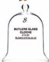
BUTLERS GLASS CLOCHE £16.90 at Butlers-online.co.uk