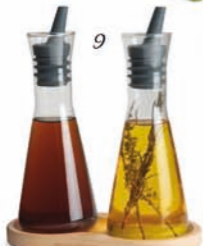
UNIVERSAL EXPERT BY SEBASTIAN CONRAN OIL & VINEGAR SET £30 at Qooq-home.co.uk