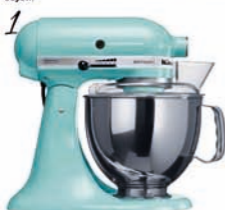
KITCHENAID ARTISAN FOOD MIXER £429 at Debenhams.com