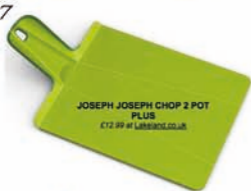
JOSEPH JOSEPH CHOP 2 POT PLUS £12.99 at Lafayette.co.uk