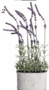
MARKS AND SPENCER LAVENDER POT £29 at Marksandspencer.com