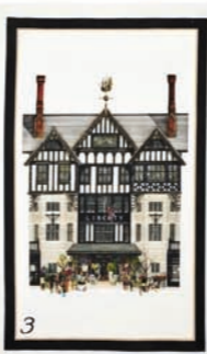
LIBERTY COTTON TEA TOWEL £12.95 at Liberty.co.uk