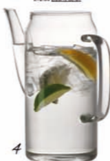
SEBASTIAN CONRAN WATER JUG £34.99 at Lafayette.co.uk