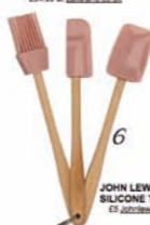
JOHN LEWIS MINI SILICONE TOOLS £5 at Johnlewis.com