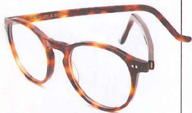
Chartwell 12 spectacles , £380: CW Dixey & Son: 01932-867467, www.cwdixeyandson.com