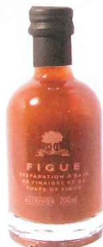
A L'Olivier fig vinegar , £7.15, The Oil Merchant: 020-8740 1335, www.oilmerchant.co.uk