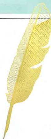
Tool The Bookworm quill bookmark , £12, Tom Dixon: 020-7183 9737, www.tomdixon.net