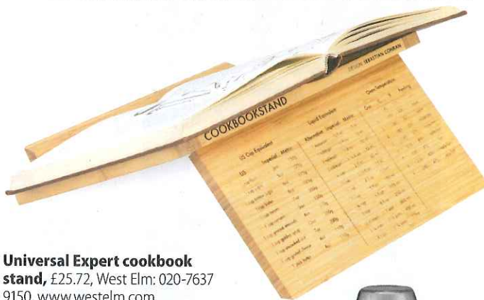
Universal Expert cookbook stand , £25.72, West Elm: 020-7637 9150, www.westelm.com