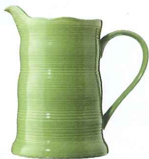
Verdi water jug , £38.25, Oka: 0844-815 7380, www.okadirect.com