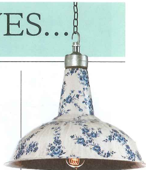
Flying Scotsman shade , £570, Dyke & Dean: 01424-429202, www.dykeanddean.com