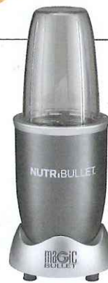
Superfood nutrition extractor , £99.95, Selfridges: 0800-123400, www.selfridges.com