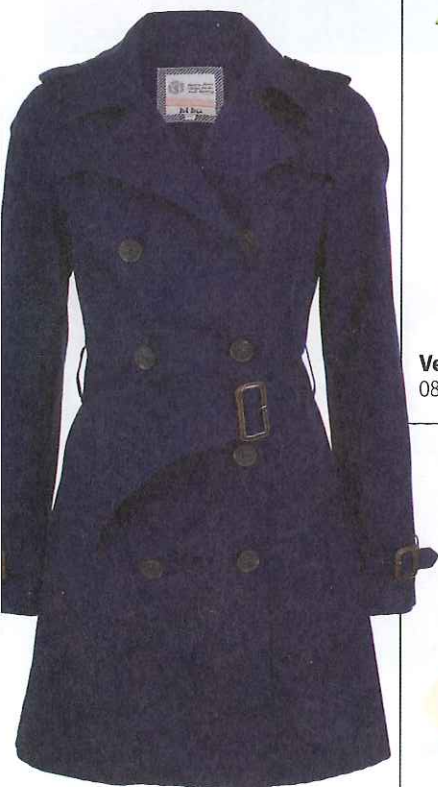
Tunbridge trench , £78, FatFace: 0870-600 0090, www.fatface.com