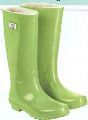
Sheepskin wellingtons , £145, Thorn & Field: 01483-565800, www.thornandfield.com