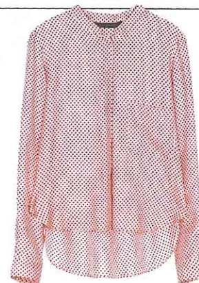
Star print blouse , £29.99, Zara: 0800 030-4238, www.zara.com