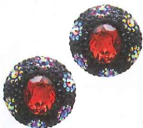
Crystal circle earrings , £48, Butler & Wilson: 020-7409 2955, www.butlerandwilson.co.uk