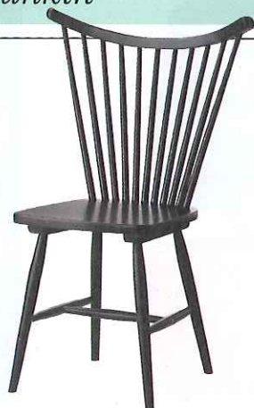
Trendig 2013 chair , £60, Ikea: 020-3645 0000, www.ikea.com