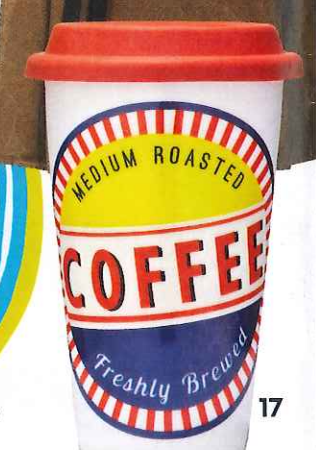
1 Oven mitt, £15, Stuart Gardiner at Lowie 2 Paella pan, £12.50, rice, £4.75, and spatula, £3.50, all Baileys 3 Andy Warhol-inspired soup can, 95p, Campbell's 4 Tiffin box, £28.99, Tiffinware 5 Gabriel Boudier crème liqueur miniature gift set, £18.95 (for five 4cl bottles), Harrods 6 Cushion, £44.50, Nikki McWilliams 7 Fruit juicer, £22, Sebastian Conran at Universal Expert 8 Coffee dippers, £5.95 (for a set of six), Flavour Sense Nation at Harvey Nichols 9 Coasters, £48 (for a set of four), Jonathan Adler at Amara 10 Chilli-growing kit, £4, Waitrose 11 Bomba! tomato purée, £1.99, Waitrose 12 Apron, £38, Labour And Wait 13 Jar, £5.75, Le Parfait 14 Marshmallows, £6 (for six), The Marshmallowists 15 Foodie Garden kits, £18 each, Poketo at Austique 16 Chopping board, £32, Marimekko at Amara 17 Travel mug, £10, Debenhams